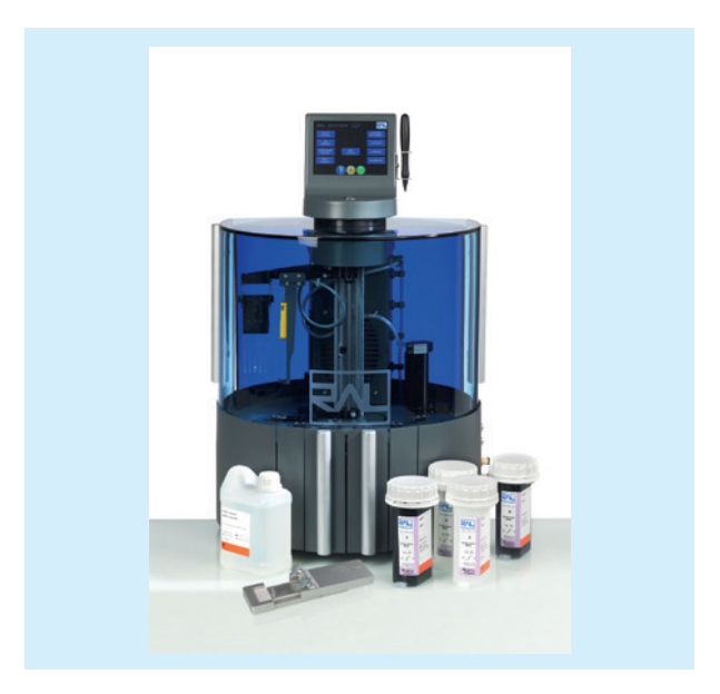
Fig. 3: Blood Film Master Advanced: HemoSlider, RAL Stainer* and RAL Kit MCDh*